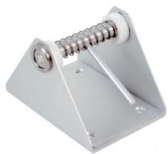
24-Deep Well Plate Clamp