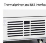
Quick release filter design