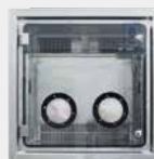
Inner glass door