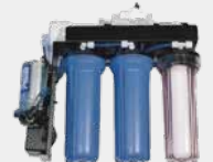
Reverse osmosis water purifier