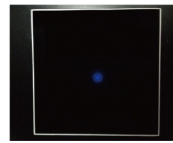
Center position indicator