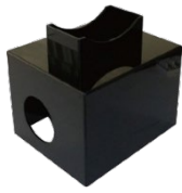
UV protective cover, easy and safe to cut gel