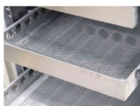
Stainless steel perforated sliding drawers