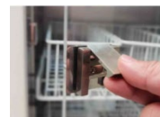
Acrylic inner door design