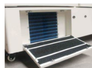
Quick release filter