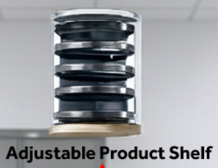
Adjustable Product Shelf