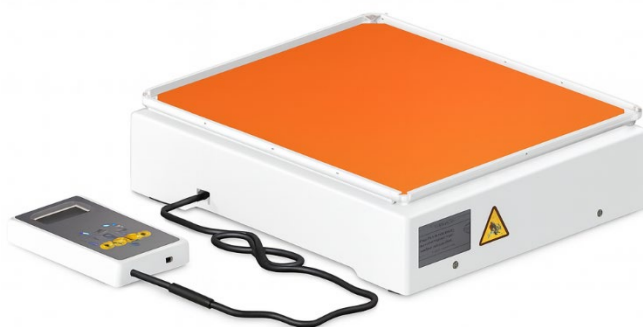
CO2 Resistant orbital shaker