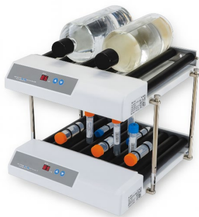
CO2 Resistant mini roller