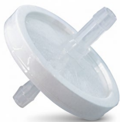
Co2 inlet HEPA filter 1 year service life Model:-DS-A15