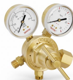
CO2 cylinder pressure regulator model:DS-A25