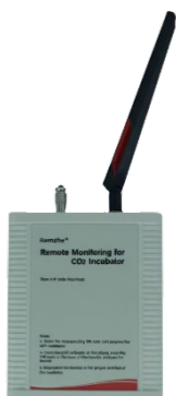
Remote monitoring for co2 incubator model:-DS-A19