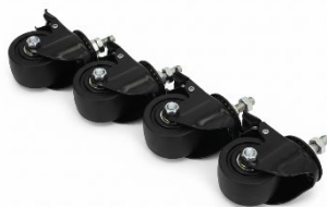
Caster wheels model:-DS-A28