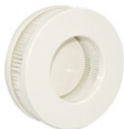
Chamber HEPA filter 1 year service life mode:- DS-A13