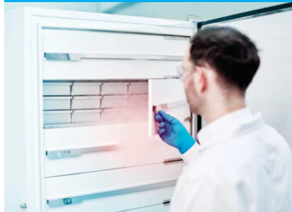
Racks with drawers for upright freezers