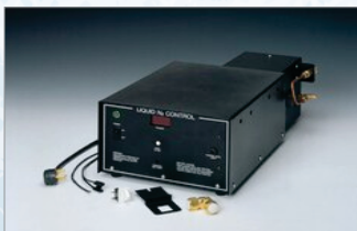
Co2 / Ln2 Backup System