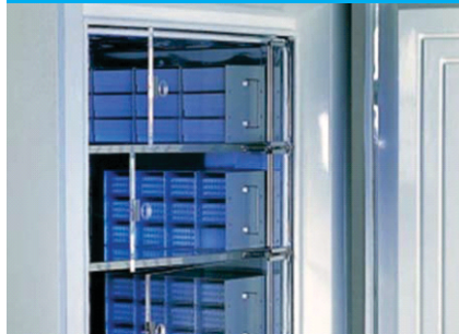
Application-oriented space utilization solutions provide increased variability and user-friendliness