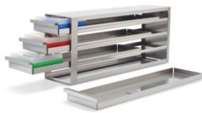
Front sliding rack