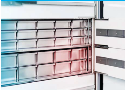
Darsun deep-freezers are characterized by first-class craftsmanship and high flexibility