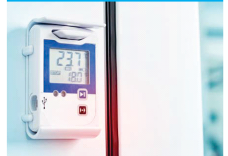
The data logger can be fixed to deep-freezers magnetically and configured or read via a USB interface