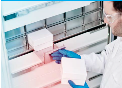
Upright freezers with flexible loading options