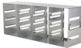
Side sliding rack